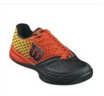
WRS321220 MENS RUSH...OW.jpg