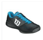
WRS321970 MENS GLID... LUE.jpg