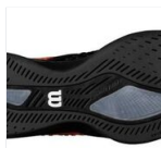
WILSON GLIDE SOLE.jpg