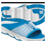
WRS317010 W REELAX ... LS.png