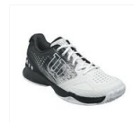
WRS322210 MENS KAO... ITE.jpg