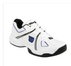
WRS319350 MENS NVIS... ACK.jpg