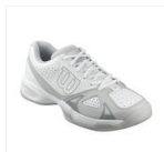
WRS320690 MENS RUSH...REY.jpg