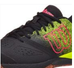
WRS323290 GLIDE COMP.jpg