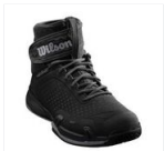
WRS324200 MENS AMP... NY.jpg