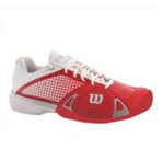
WRS316970 RUSH RED ... VER.jpg